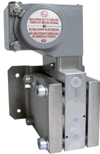
Compact differential pressure switch model DE